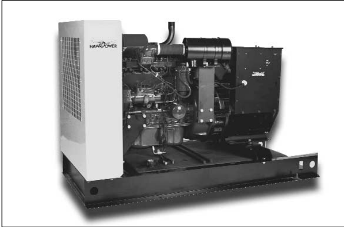
**Photo displays GS32D-LP Generator set for illustration purposes only.